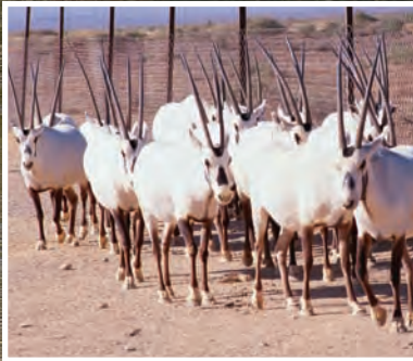
↑ Arabian Oryx at the Shawmari Wildlife Reserve.