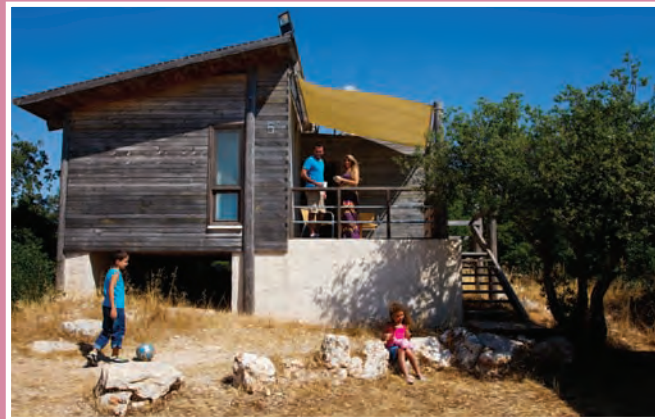
↑ Cabins at the Ajlun Nature Reserve.