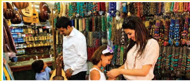
↑ Shop for souvenirs and handicrafts in downtown Amman.

Arab artists. Most galleries are condensed in the Jabal Amman area or close by.