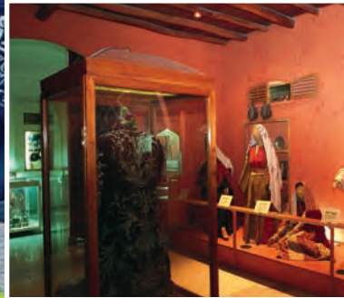
↑ The Jordan Museum of Popular Traditions.