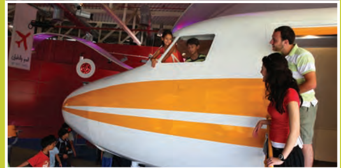
↑ The Children's Museum.

Designed for children aged 14 and under, the facilities provided by the museum include an exhibit hall, a multipurpose hall, a children's library and IT centre, an activity room, an outdoor exhibit area, an outdoor theatre, a museum shop, a birthday room, a cafe and a planetarium - a must see for all visitors coming to Jordan with their families.