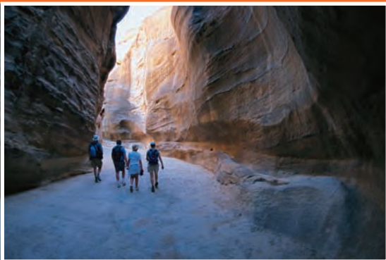
↑ Walking through the Siq to the Treasury at Petra.