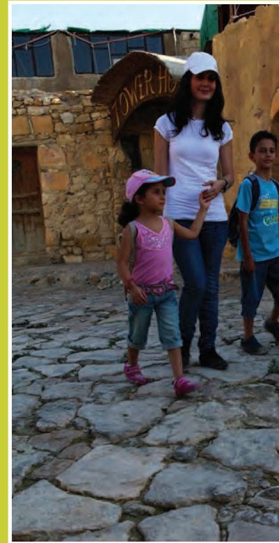
↑ A family stroll at Dana Village.

Where the mountains meet the desert to the west, the award winning 26-room Feynan Ecolodge is a beacon for sustainability with solar power and a host of green practices. Secluded in nature, the tranquil lodge is ideal for family bonding time. Activities include mountain biking, daylong canyoning adventures, discovering archaeological ruins, and delving into some of the world's oldest copper mines alongside Bedouin guides from the local community.