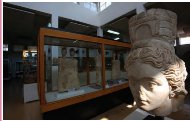
↑ The Jordan Archaeological Museum.

This gallery hosts a superb collection of paintings, sculptures, photographs, installations, and ceramics by contemporary Jordanian and international artists. It aims to encourage cultural diversity and promote art from the Islamic and developing world.