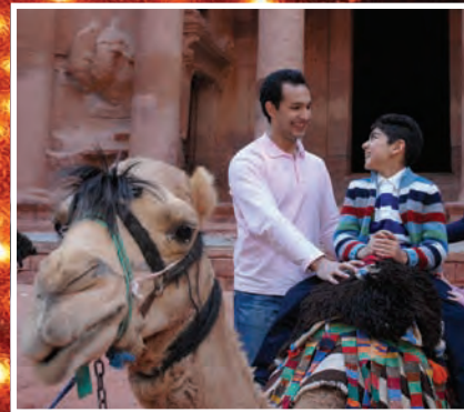
↑ Riding camels in Petra