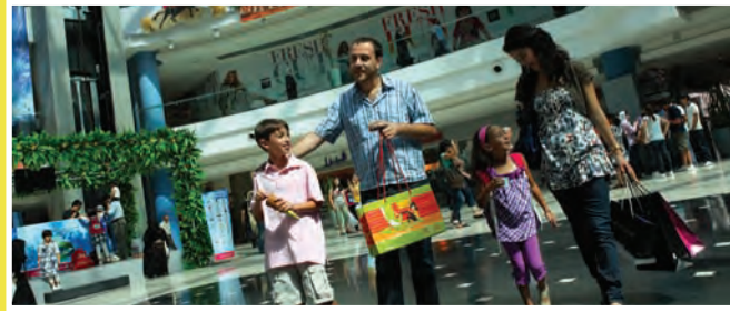
↑ Enjoy a shopping spree at one of the many shopping malls.

In addition to its numerous archaeological sites, Amman offers the art lover many galleries, showcasing the works of local and