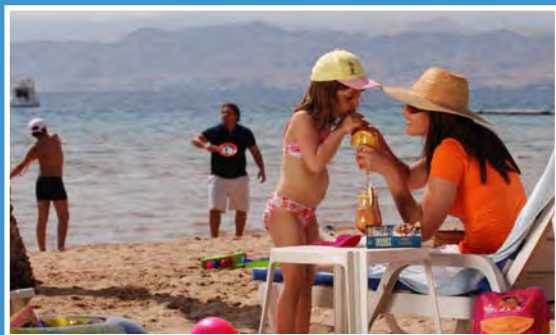
↑ The clean and safe beaches of Aqaba.