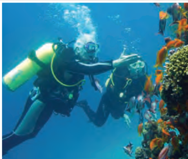
↑ Deep-sea diving in Aqaba.