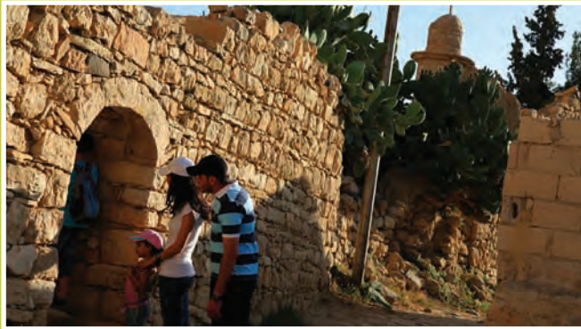
↑ Dana Village.