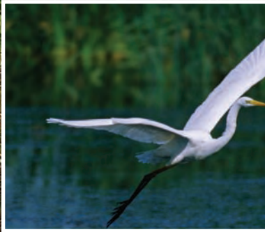
↑ Birds at the Azraq Wetland Reserve.