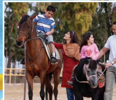
↑ Horseback riding at one of Jordan's many horse clubs.