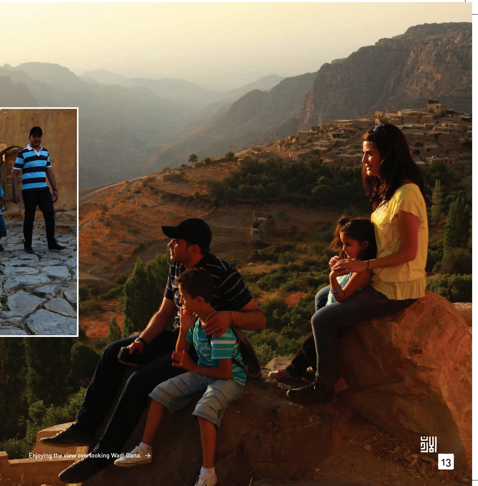
Enjoying the view overlooking Wadi Dana. →