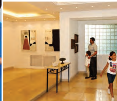
↑ Art Gallery.