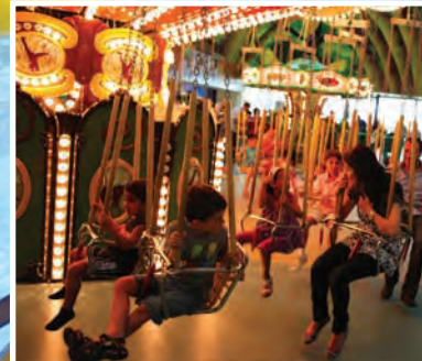
↑ Visit one of the many kids' clubs. ← Splash around at the waterpark.