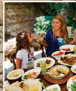
↑ A delicious family lunch.