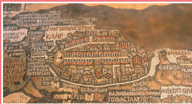
↑ Mosaic map of the Holy Land.

Just 30km from Amman is one of the most memorable places in the Holy Land. Madaba is an ancient town on the Jordanian Plateau that was resettled by Christian Arab tribes from the Karak region. Madaba's chief attraction can be found in the contemporary Greek Orthodox