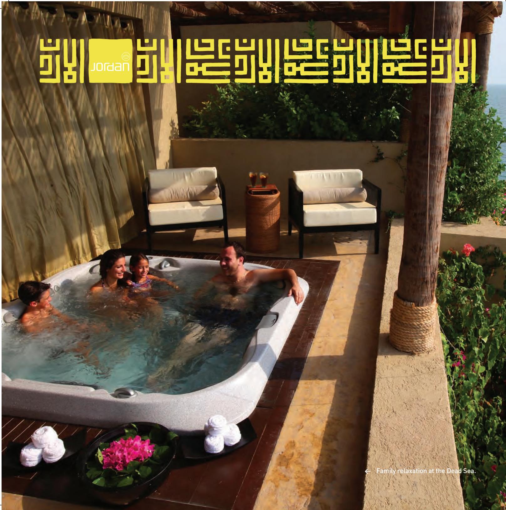
← Family relaxation at the Dead Sea.