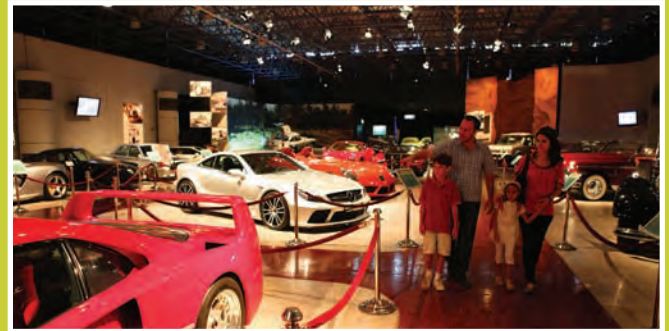
↑ The Royal Automobile Museum.