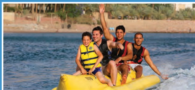
↑ Enjoying a banana boat ride in Aqaba.