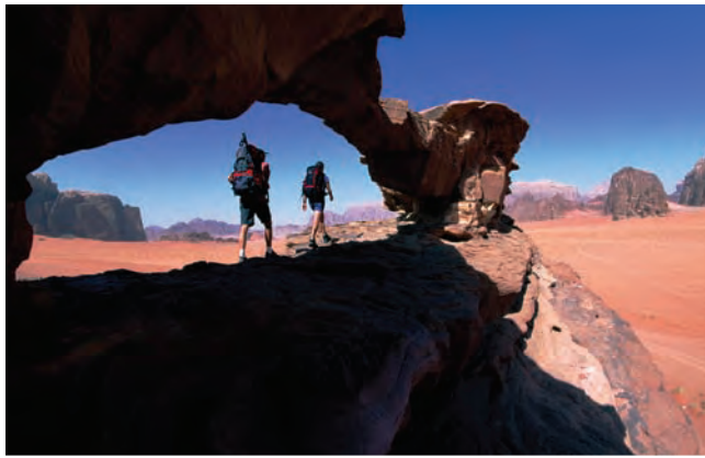
↑ Rock bridge in Wadi Rum.