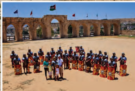
↑ The Roman Army Chariot Experience at Jerash.