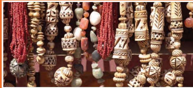
↑ Jordanian handicrafts.

the highest point in Petra. The family can head down the wadi to Little Petra if they still have the time to do so. It is not as monumental as the main site itself but there is still much more to see there.