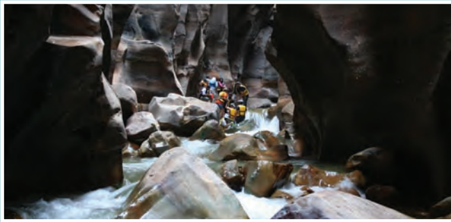
↑ The Wadi Mujib gorge.